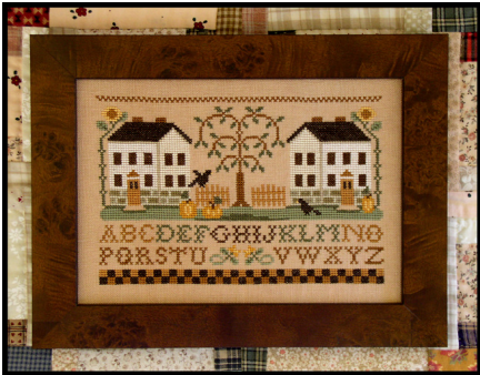
Two White Houses

Fall is around the corner! Revisit some LHN oldies but goodies!