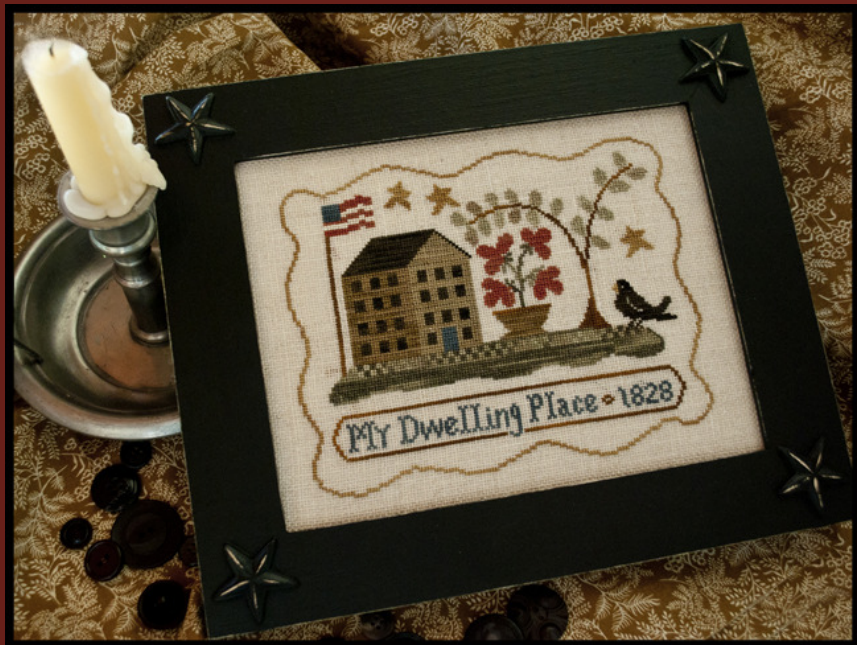
My Dwelling Place