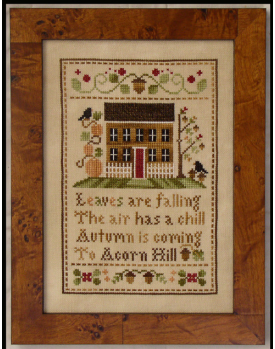
Autumn Harvest and Acorn Hill