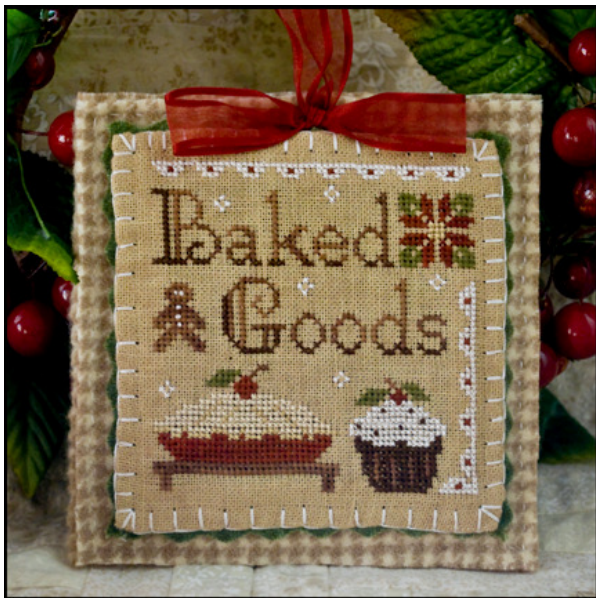
Ornament of the Month!

This is the third and last design in the package. I designed it using the colors from the other two designs. That's Lear. . . . . see her there to the right of the house?? I put her in a beautiful Colonial home where she is now living happily ever after! I stitched the blue house by reversing the silk strands instead of realigning them to put them in the needle. This created more of a mottled look rather than a stripe. The antique styled frame is from Crescent Colours as are the gorgeous silks used in the design. You will find a conversion to overdyed cottons in the package if you wish to stitch with them instead of silk.