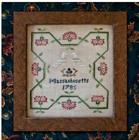
Massachusetts Adaptation Sampler

The design we call “Lear’s Floral” is also included in the pack. I see it as a cinched top pouch filled with potpourri, a pillow filled with a heavy filler to set on a table, or framed and set in a cupboard or on a shelf. The design was faithfully reproduced as Lear designed it.